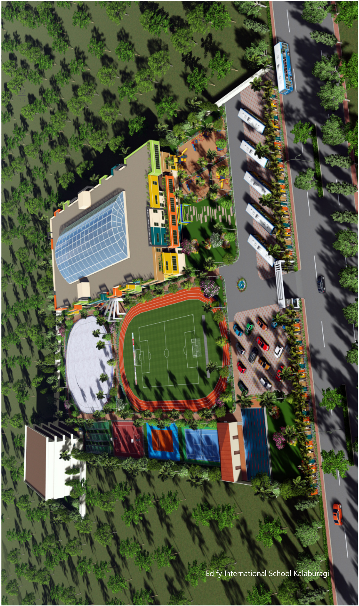
Edify International School Kalaburagi